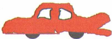
AAnghi car in Africa

(Editor's note: she meant the country Madagascar.)